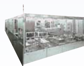
LCD coater/developer system CS800