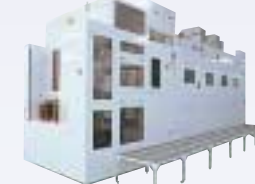
Carrierless cleaning system UW300Z