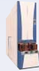
Oxidation/diffusion/LP-CVD system ALPHA(α)-303i