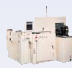
Fully automatic wafer prober P-12XL