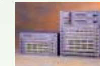
Extreme Networks, Inc. Gigabit ETHERNET Switch