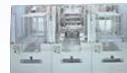
LCD plasma etch/ash system HT-800