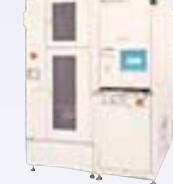
Wafer-level burn-in & test system WX-8