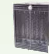
Brocade Communications Systems, Inc. Fibre Channel Integrated Fabric Switch