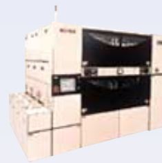
Coater/developer system CLEAN TRACK ACT®12