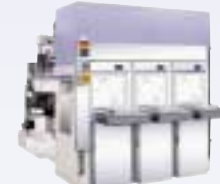
Etch system Tellus™